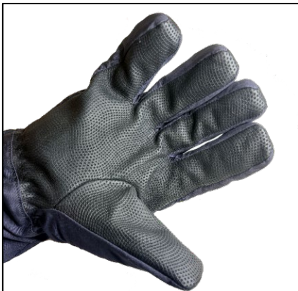
REINFORCED PALM / FINGERTIPS & TOUCH SCREEN SENSITIVE

*Classified test reports available on request