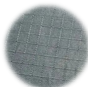
RIP-STOP SHELL FABRIC