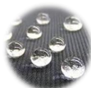
OIL & LIQUID REPELLENT

*Classified test reports available on request