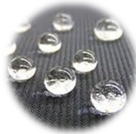
OIL & LIQUID REPELLENT